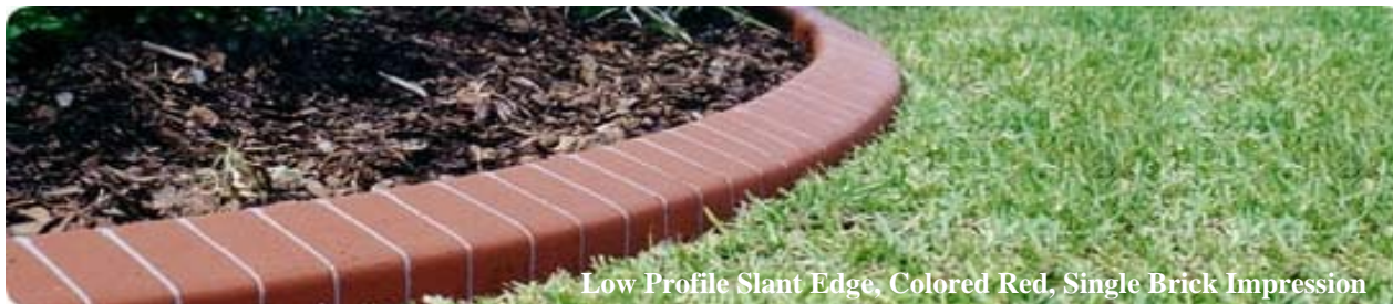
Low Profile Slant Edge, Colored Red, Single Brick Impression

A : Typically it works out best to have your curbing installed prior to your landscape materials and sod. This way sod can be laid right up to the curbing creating a clean crisp landscape.